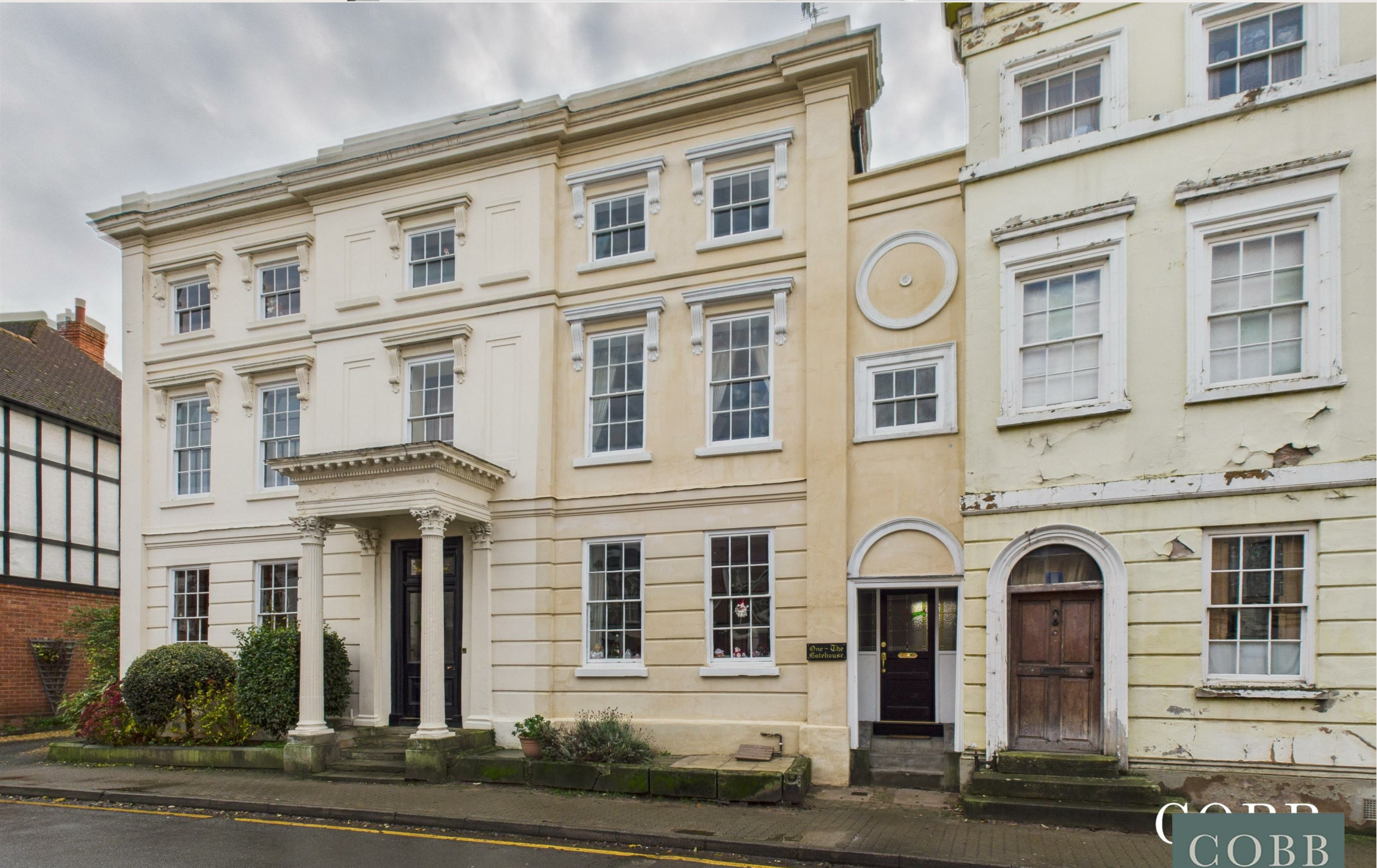
1, The Gatehouse, Church Street, Leominster, HR6 8NE Price £375,000